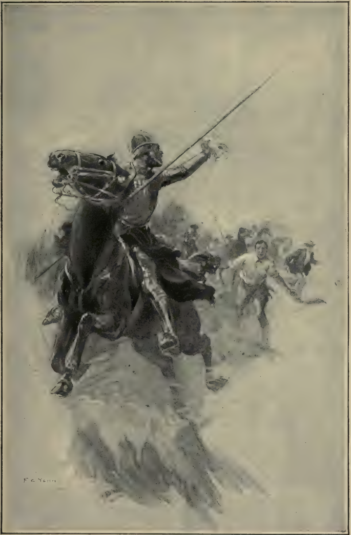
But every knight and every mounted policeman took out after the outlaw.